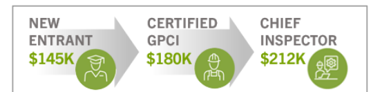
Figure 2. Average gross annual compensation of three inspection positions. GPCI=General pipeline construction inspector.

Based on hourly wage, the typical annual compensation of an inspector with increasing responsibility is shown in Figure 2.